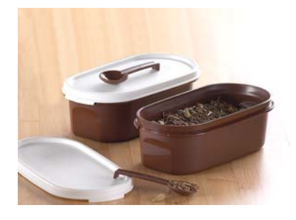
Buy 1 get 1 FREE!! Tea Storage Canisters with Spoons $40 value $20.00 Item #81927