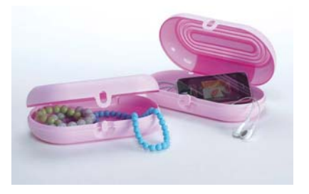
Buy 1 get 1 FREE! Oval Accessory Organizer $24 value Only $12.00 #81926 Fuchsia