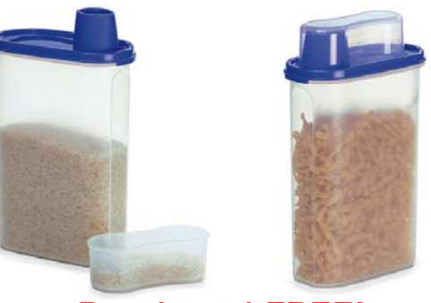
Buy 1 get 1 FREE!

Modular Measure Mate™ 9-3/4 cup w/8oz measuring cap $30 value Only $15.00