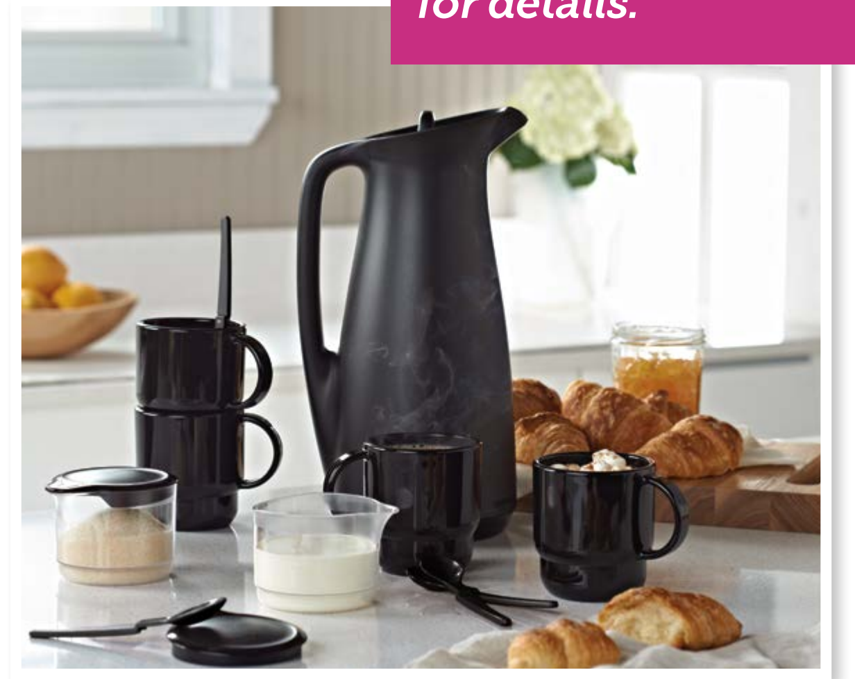
Coffee House Collection

Congratulations! Register now for Jubilee @ exclusive rate. Just add 1 registered recruit to qualify. See reverse for details.